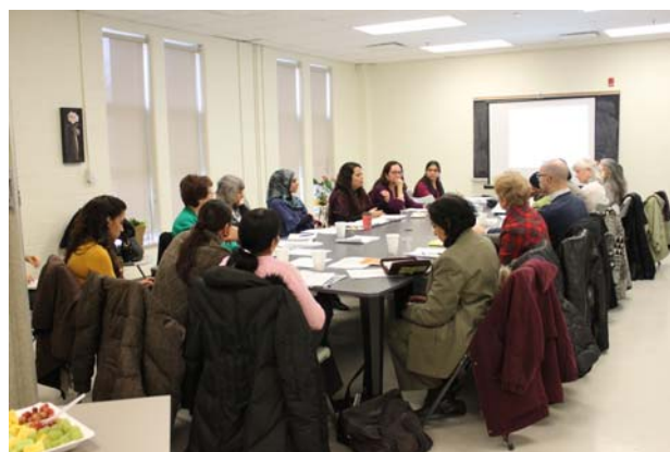
Nov 19, 2013 TWLIP Regional Council Meeting