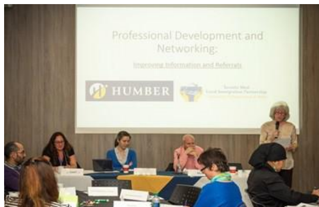
Lunch and learn event panel discussion, Oct 24, 2014

On Oct 24th 2014, Toronto West LIP and Humber College collaboratively organized a lunch and learn event - "Professional Development and Networking: Improving Information & Referrals." The event highlights included a panel discussion on the recent changes to the immigration and citizenship policy, and a case study session to explore how frontline workers respond to challenging cases and to assess the extent of their knowledge/awareness around appropriate information and referral to services and programs for their clients.