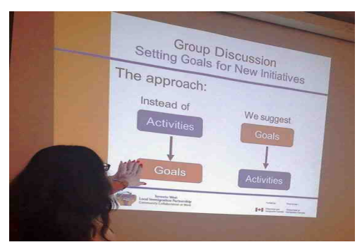
March 10, 2015 Planning & Coordinating Committee (PCC) Meeting